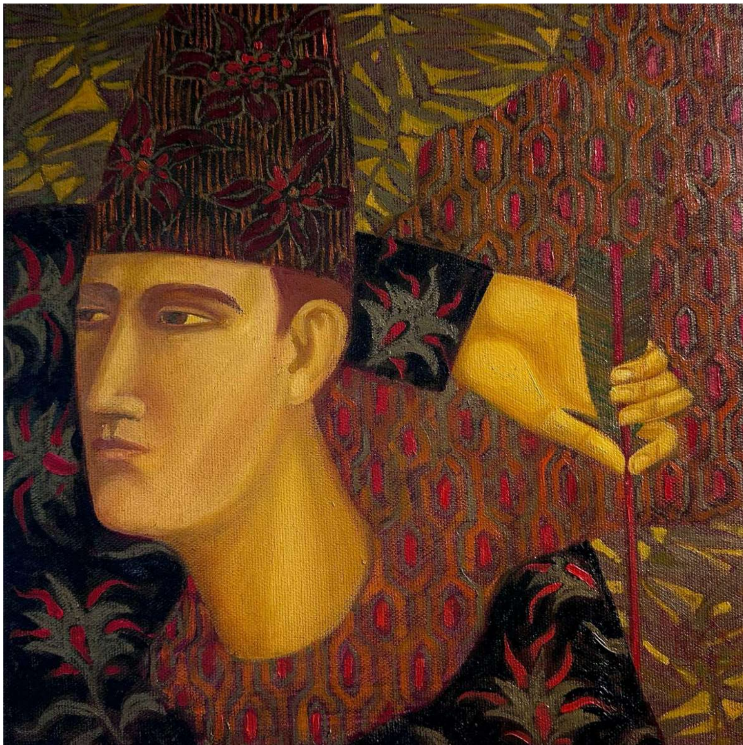
Hunter Oil on canvas 30cm x 30cm 2020 1400 USD