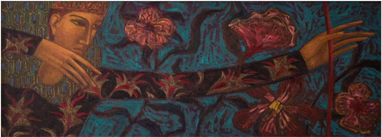
Archer 30 X 82 cm Oil on canvas 2022 6,822 USD