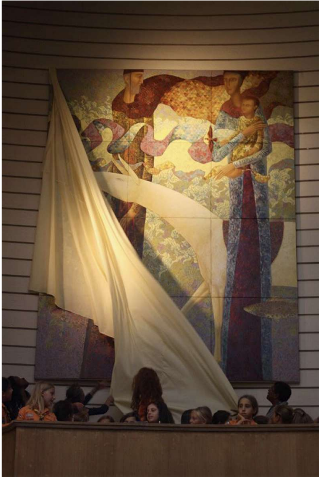
Notre de chapel, London