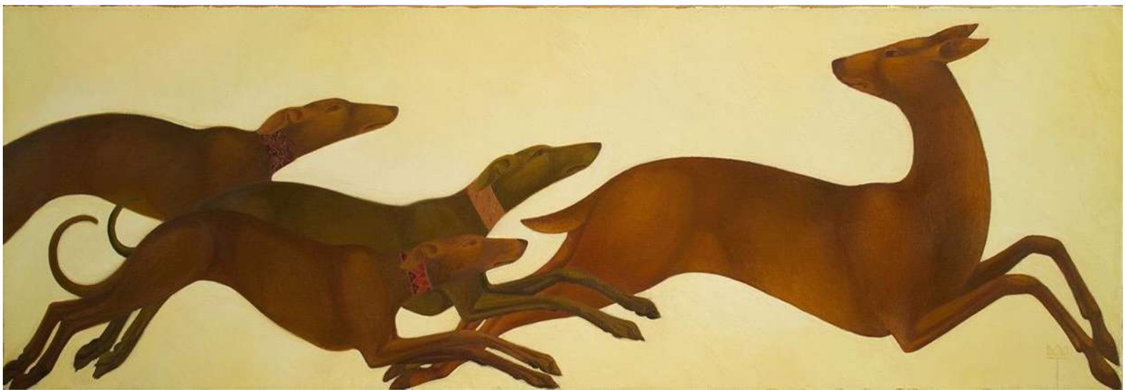
Chase 50X165 cm Oil on canvas 2019 8,000 USD