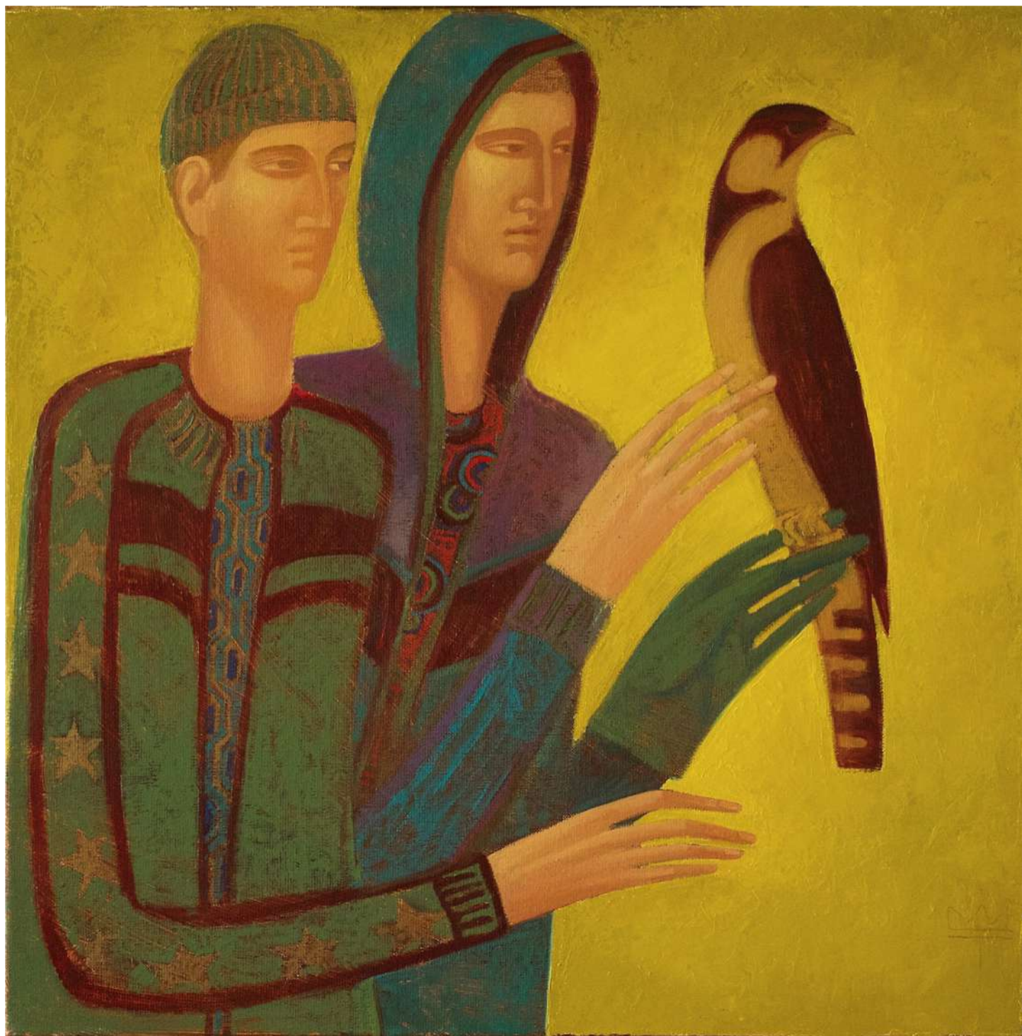
Two Hunters 60 x 60 cm Oil on canvas 2022 7,742 USD