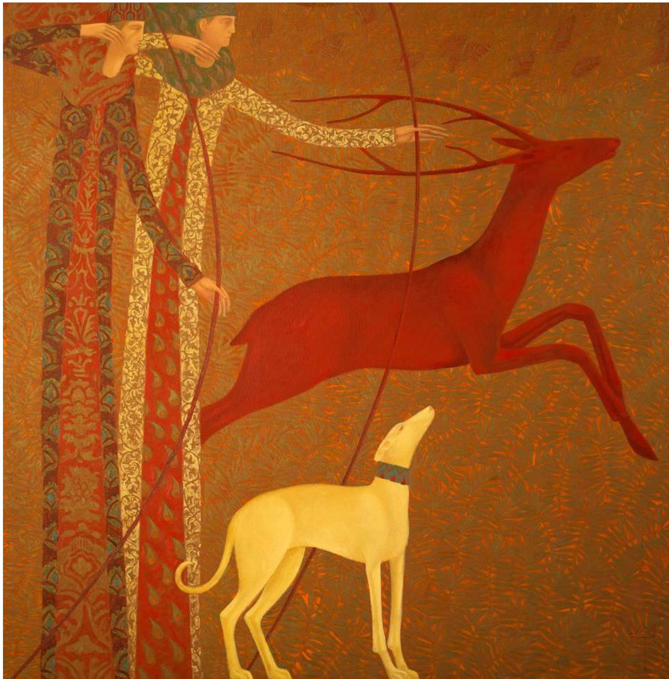
Arcadian Hunt 122 X 122 cm Oil on Canvas 2024 19,887 USD