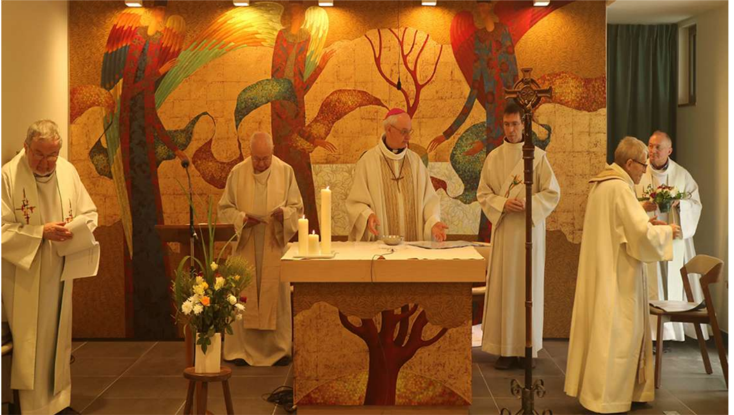
Blessing of the Altar. France, Coutances