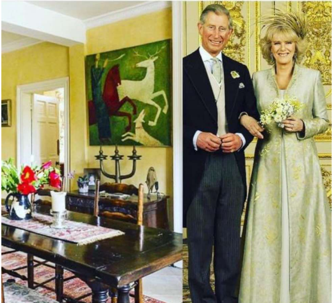
British Royal Family