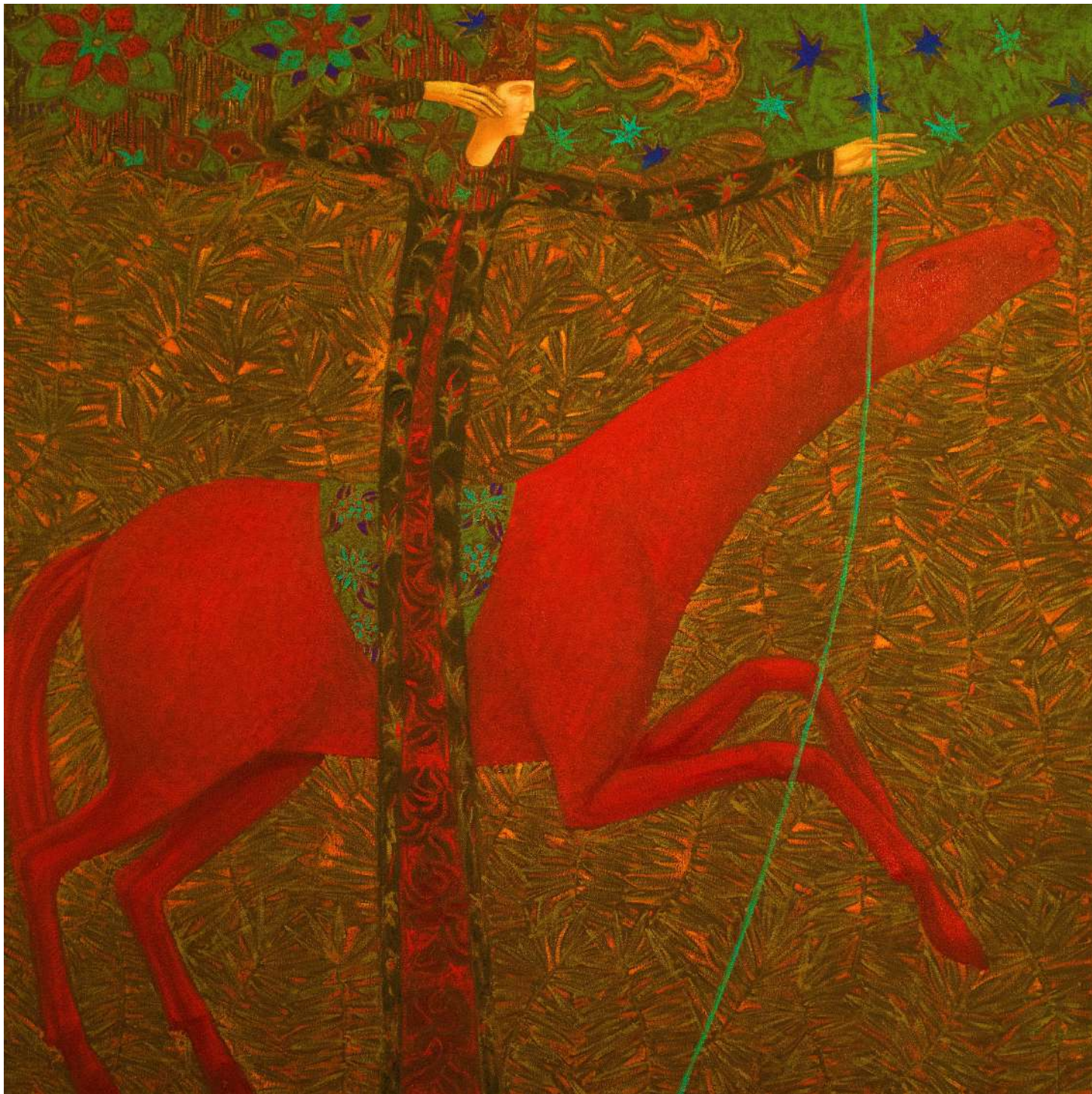
Archer on the Red Horse