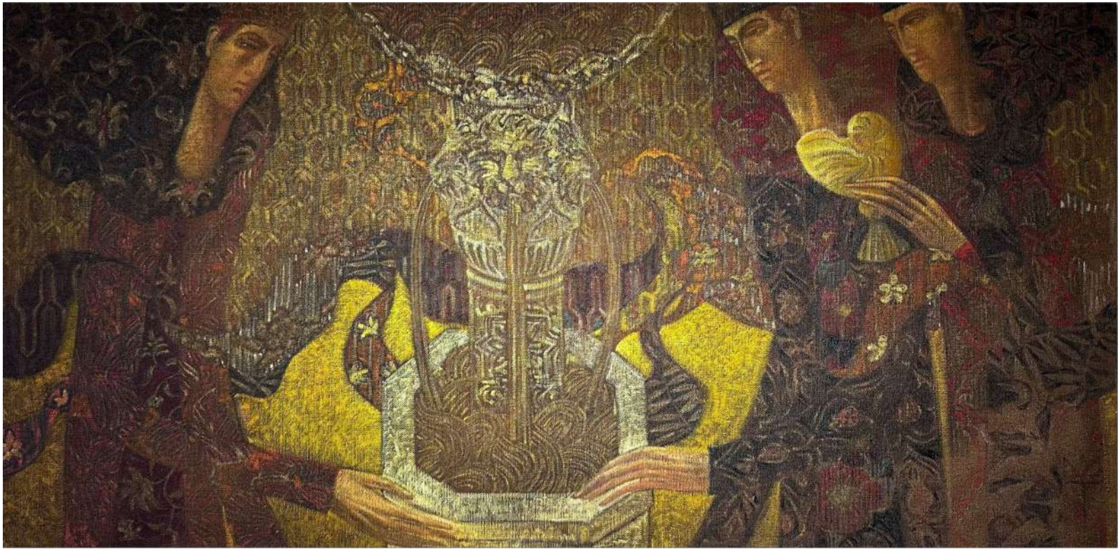
Fountain 50X100 cm Oil on canvas 2017 7,600 USD