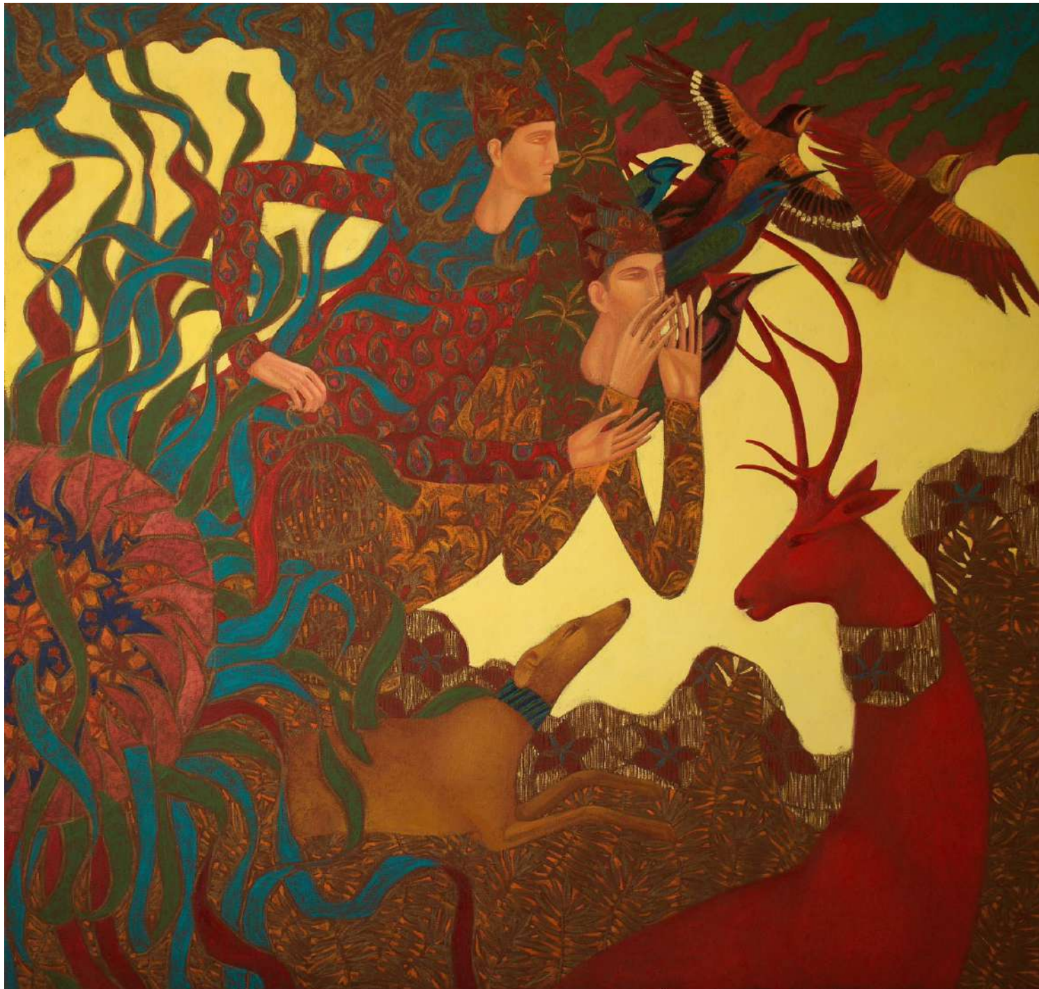
Bird Catchers 122 X 127 cm Oil on Canvas 2023 18,320 USD