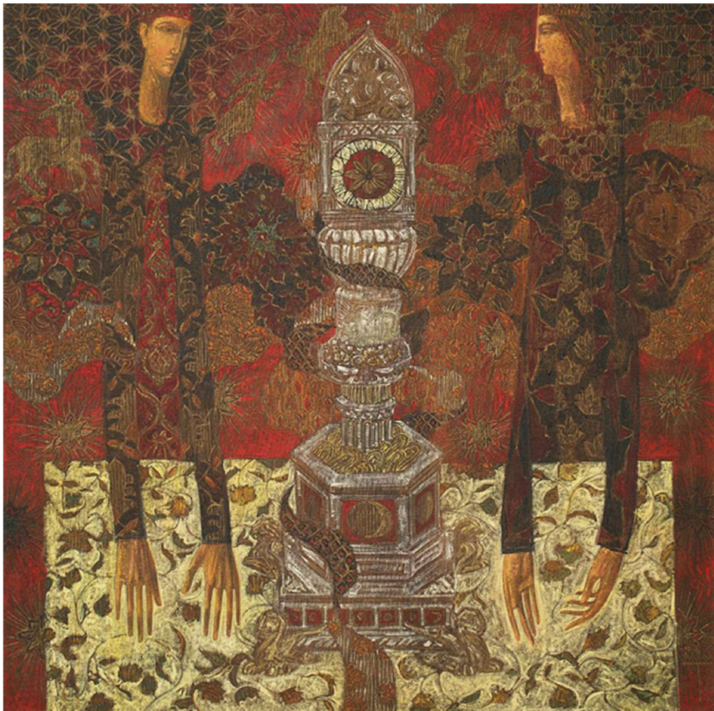
Eternity 112 x 112 cm Oil on canvas 15,587 USD