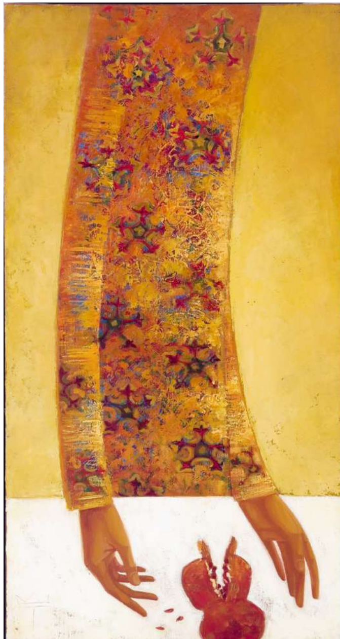
Pomegranates 80 X 40 cm Oil on Canvas 2017 4,515 USD