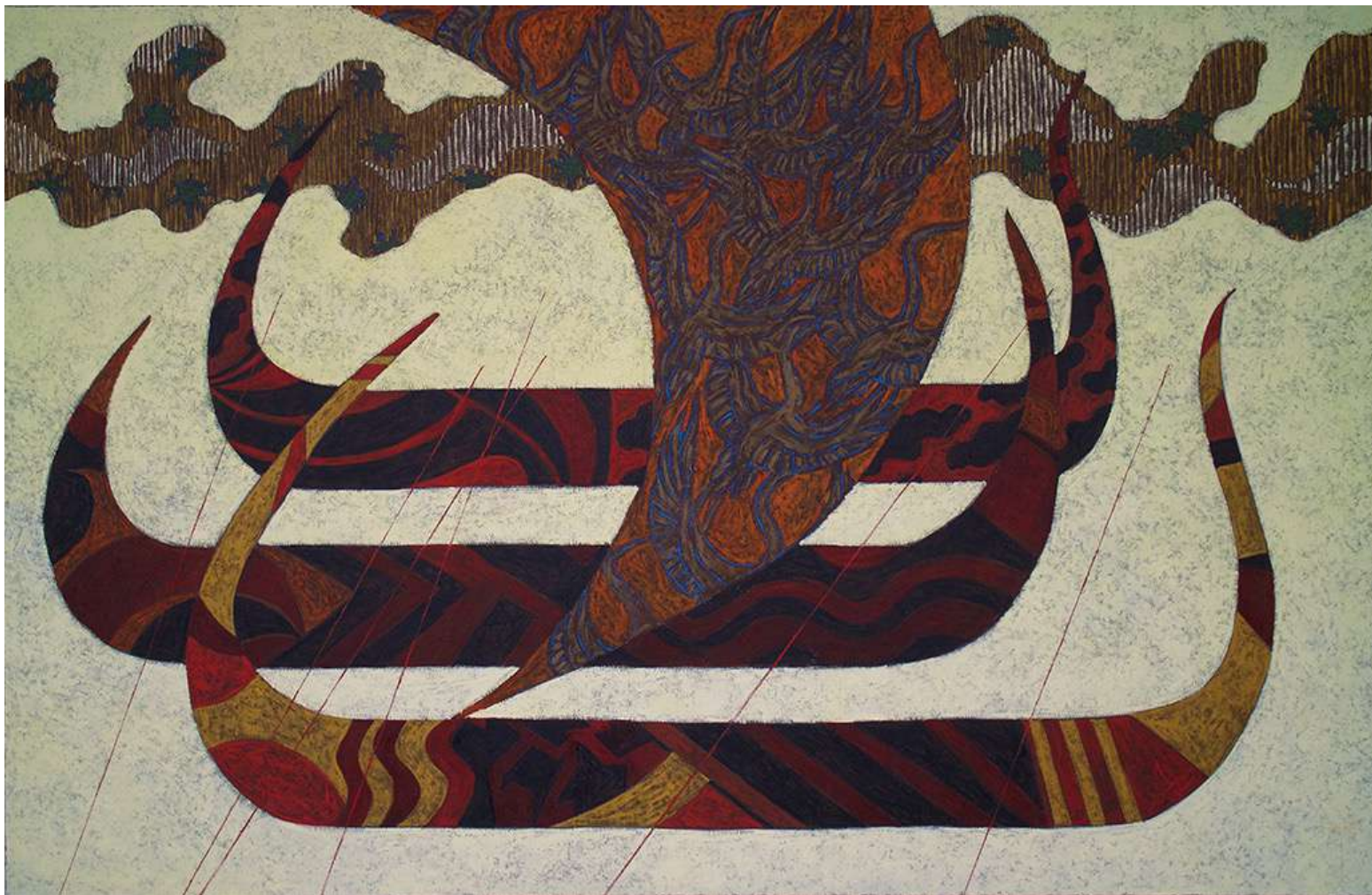
Long Boats 130 X 200 cm Oil on Canvas 2023 19,785 USD