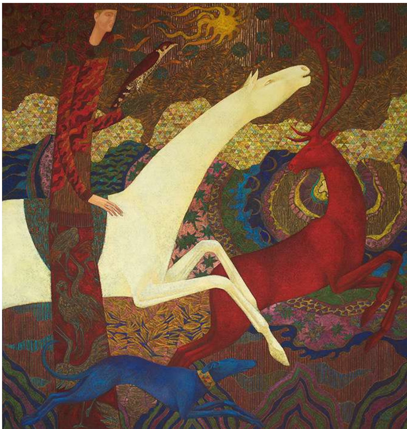
The Hunt 190 X 180 cm Oil on Canvas 2023 25,721 USD