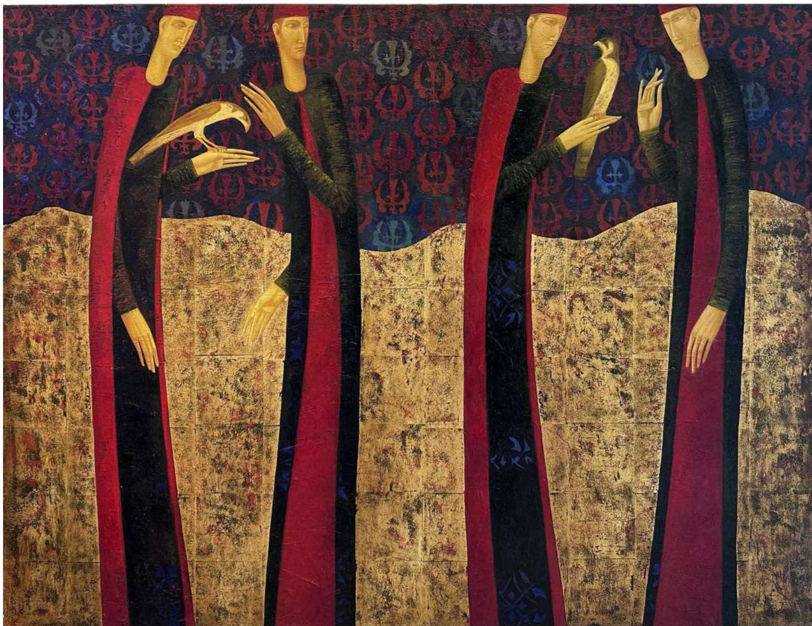
Falcons 170 x 130 cm Oil on canvas 2013 17,966 USD