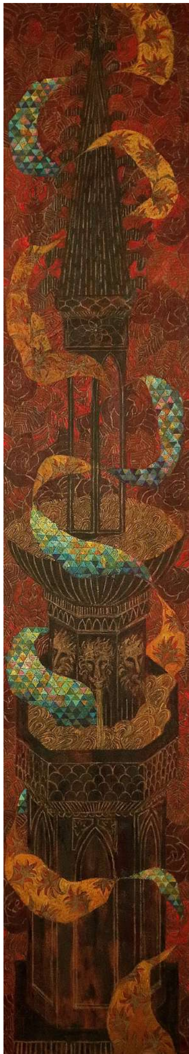
Fountain, Autums 225X40 cm Oil on canvas 2019 7,790 USD