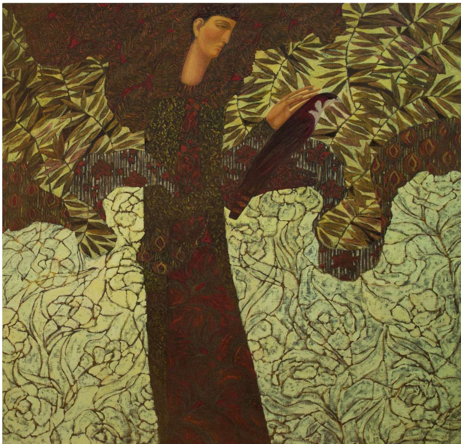
Falconer 100X100 cm Oil on canvas 2017 8,250 USD