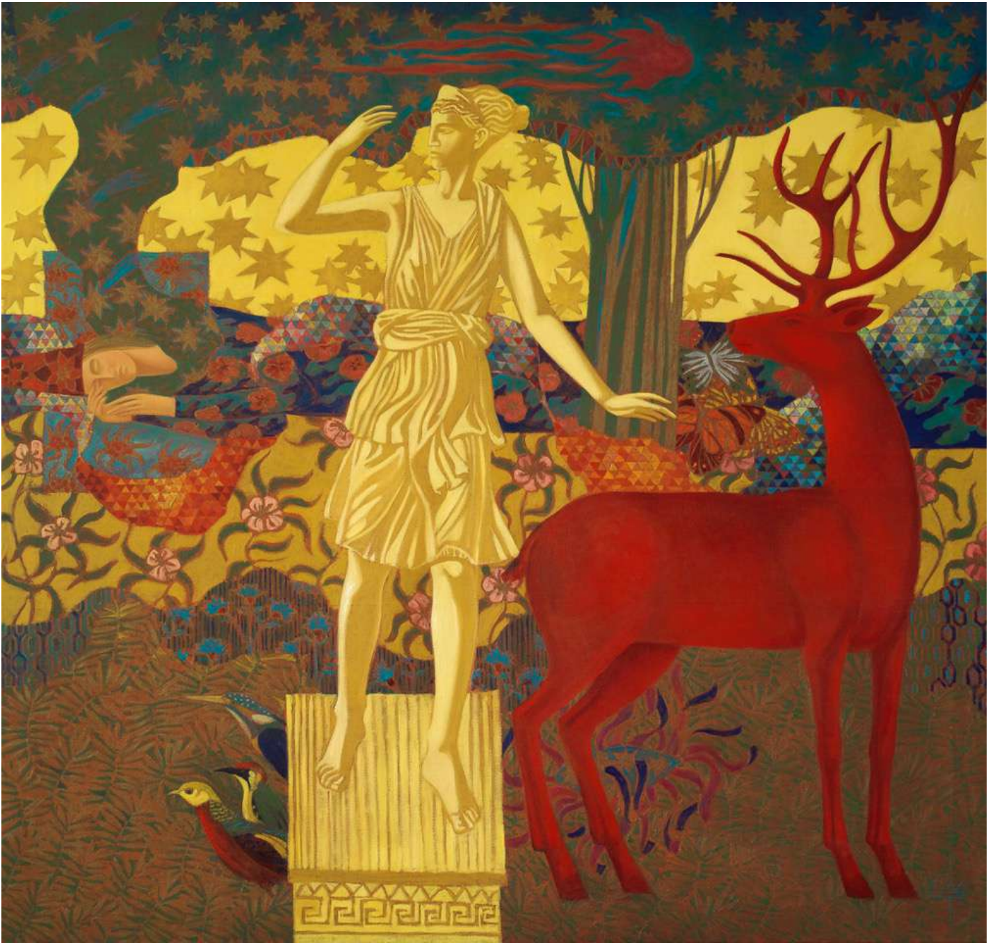
Arcadian Dream II 122 X 127 cm Oil on Canvas 2024 19,590 USD