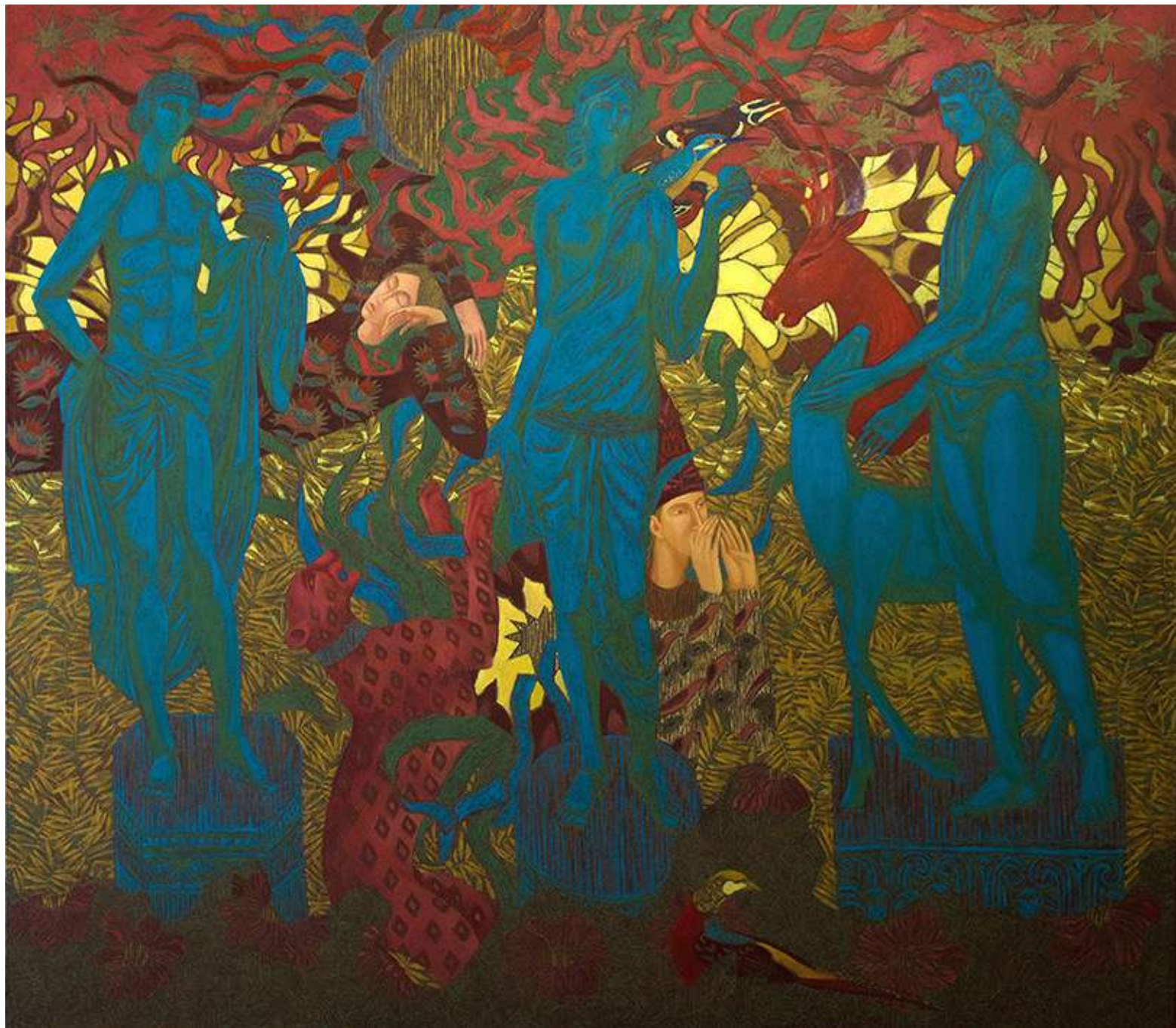
Arcadian Dream 150 X 170 cm Oil on Canvas 2023 24,402 USD