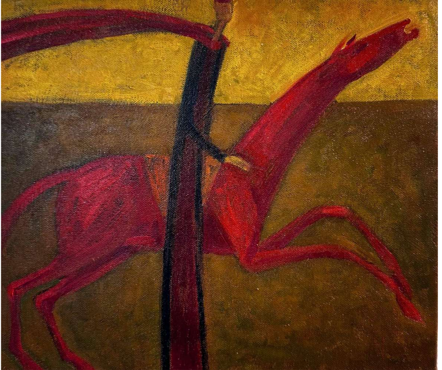
Red Horse Rider Oil on canvas 20cm x 20cm 1300 USD