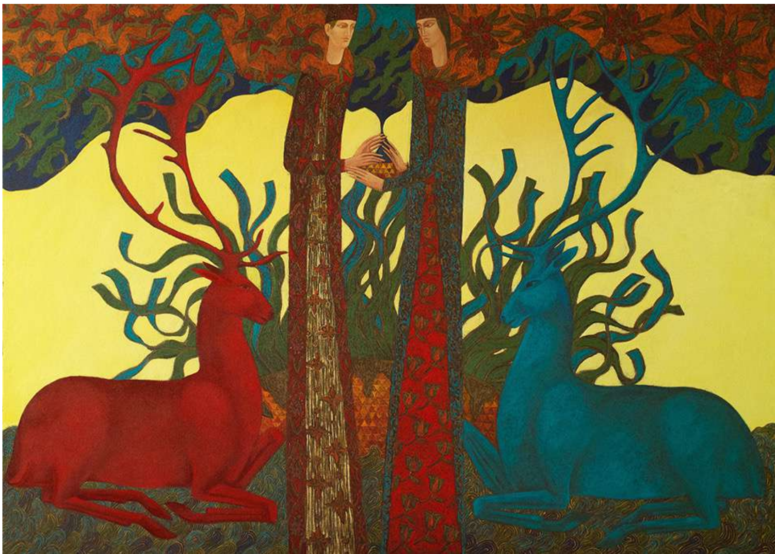
Celtic Legend 122 X 175 cm Oil on Canvas 2023 21,764 USD