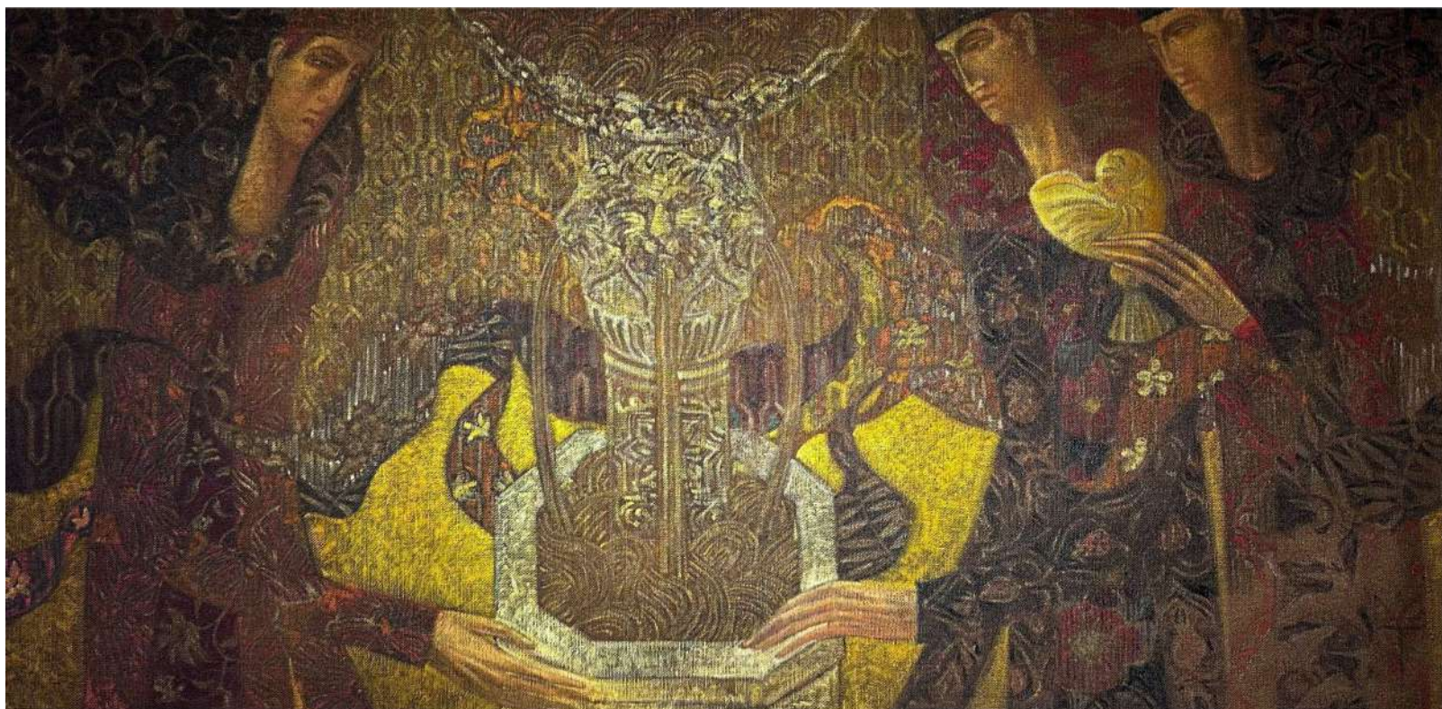
Fountain 50X100 cm Oil on canvas 2017 7,600 USD