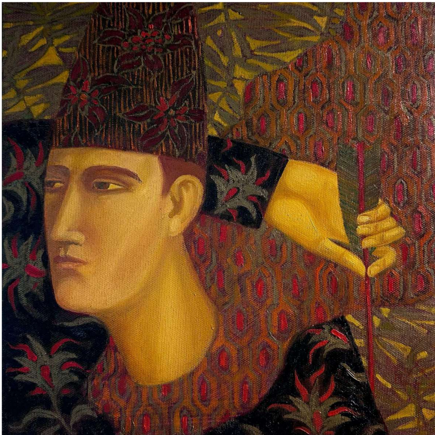
Hunter Oil on canvas 30cm x 30cm 2020 5,700 USD